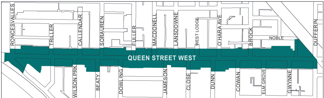
Parkdale Village BIA Boundaries

The Parkdale Village BIA is committed to improving and promoting the Parkdale Village area through investment and advocacy to maintain its position as one of Toronto's unique destinations for shopping, business, and experiencing diverse culture and entertainment.